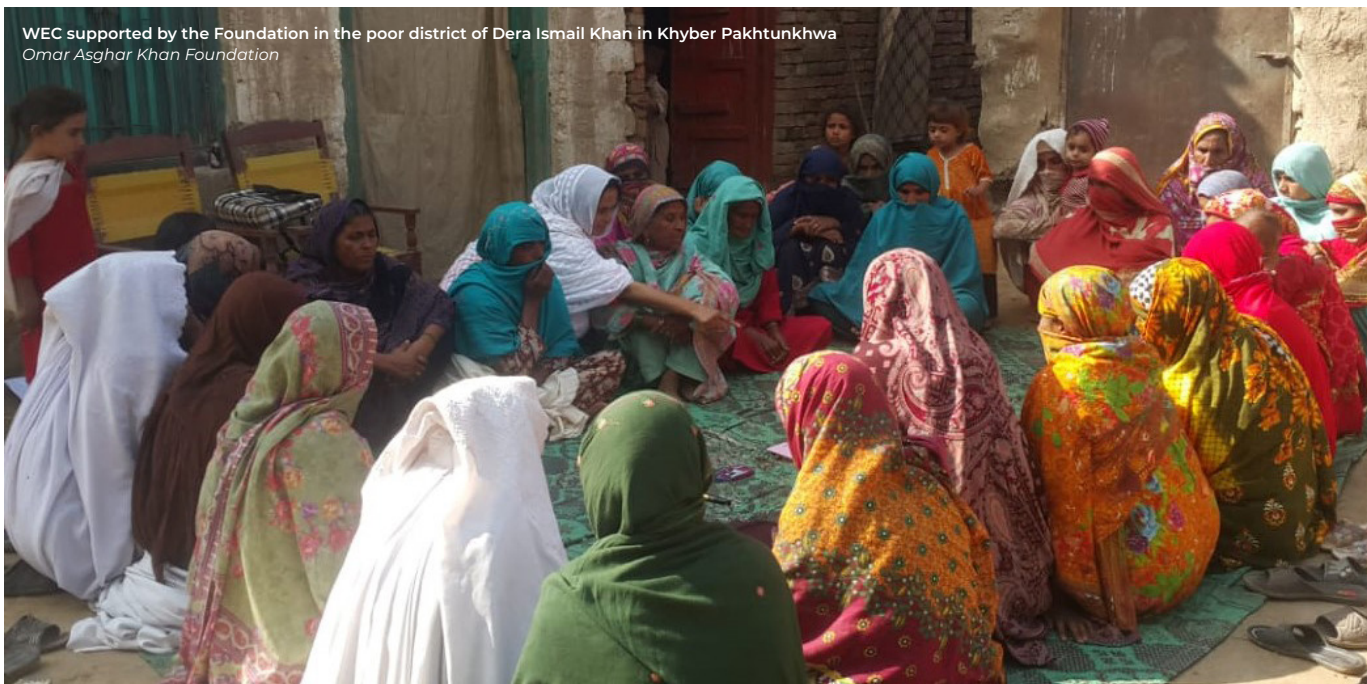
WEC supported by the Foundation in the poor district of Dera Ismail Khan in Khyber Pakhtunkhwa Omar Asghar Khan Foundation