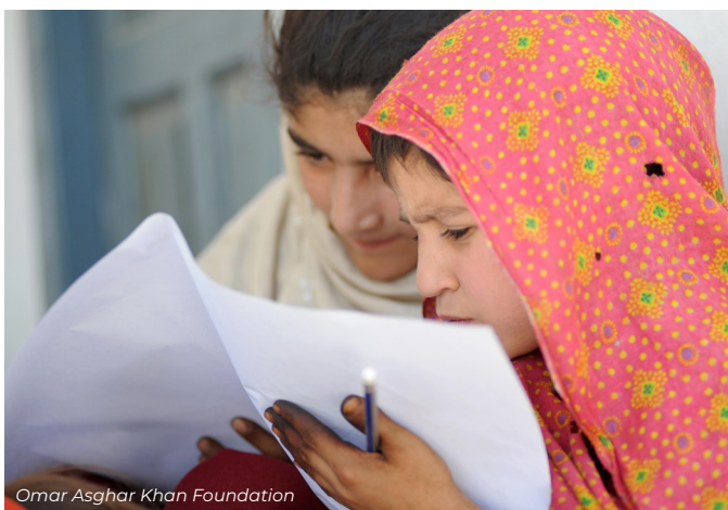
Omar Asghar Khan Foundation

WECs are critical for women who are further marginalised due to the intersectionality with poverty and other factors.